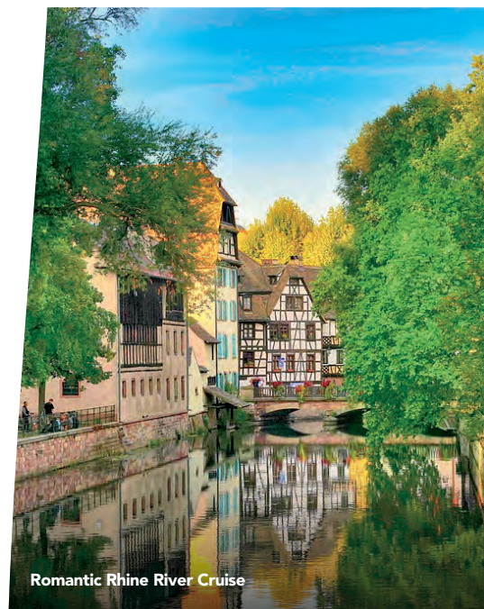
Romantic Rhine River Cruise