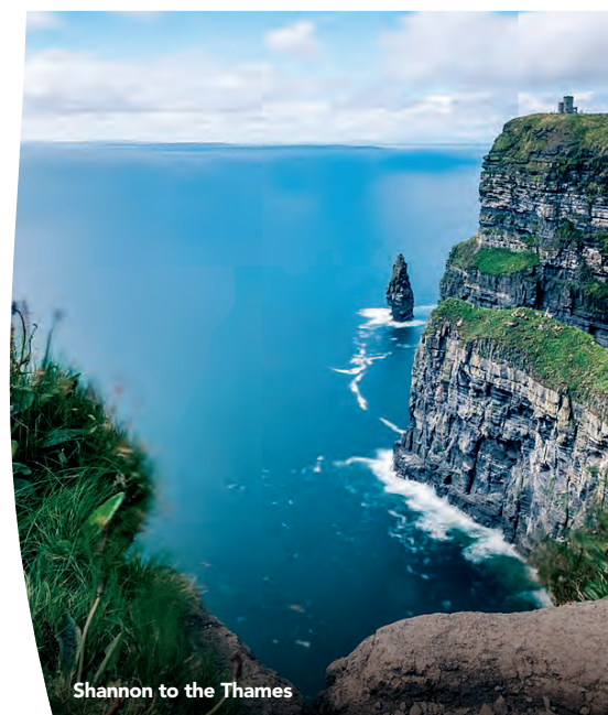
Shannon to the Thames