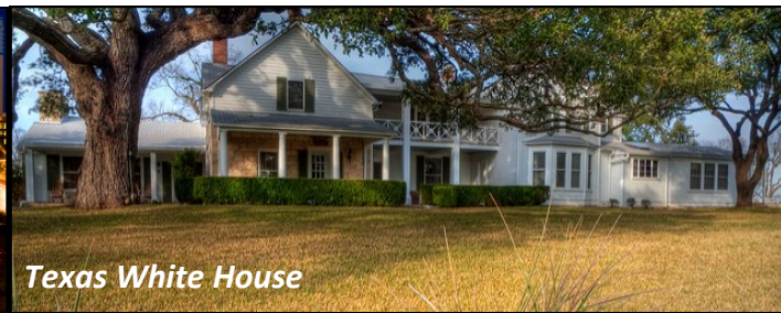
Texas White House