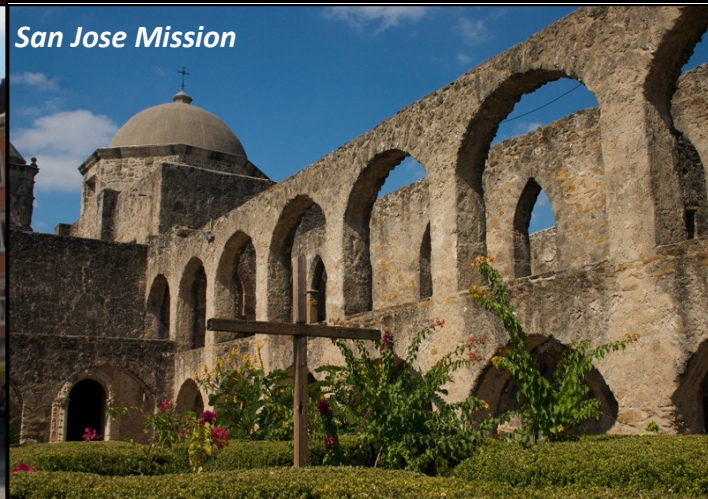
San Jose Mission